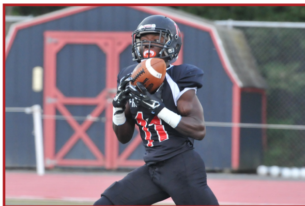
Frostburg is 3-0 against CNU and enters the matchup riding a 11-game winning streak